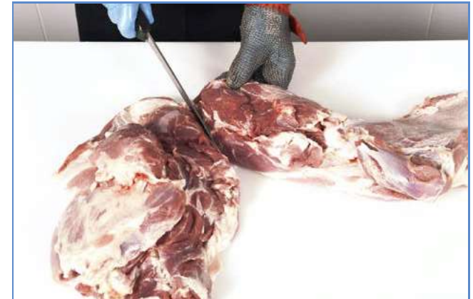
9 Cut between the feather and blade to split the shoulder in two.