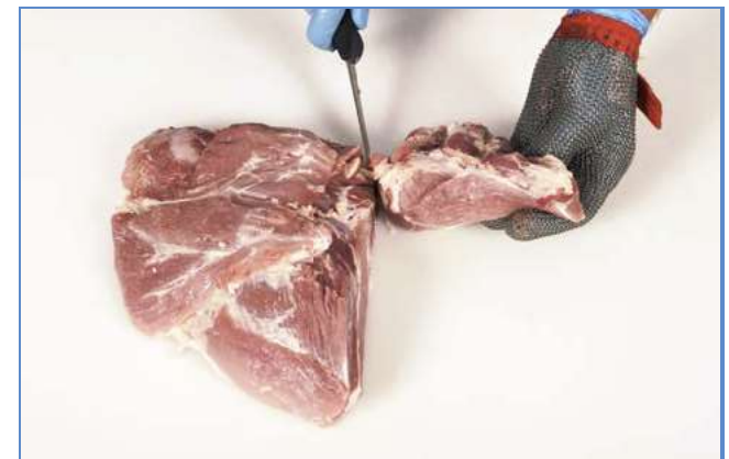
12 Remove the group of small muscles attached to the LMC as illustrated ...