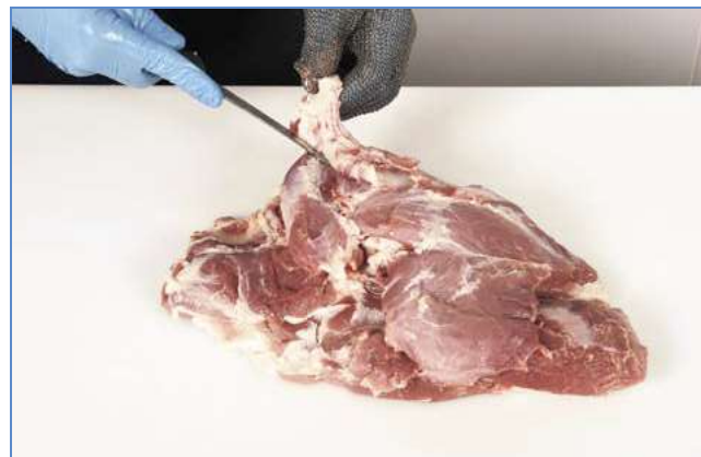
11 Remaining Feather, LMC including additional small muscle groups. Trim of excess fat and gristle.