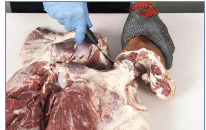
6 Remove the shank and ...