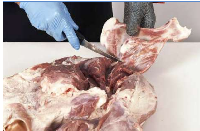
5 ... and remove.