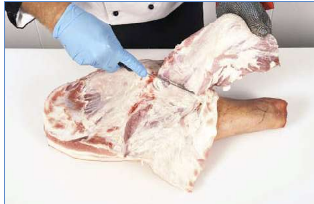
2 Seam cut the brisket muscle and fold it ...