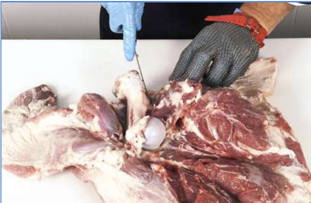
7 ... humerus.