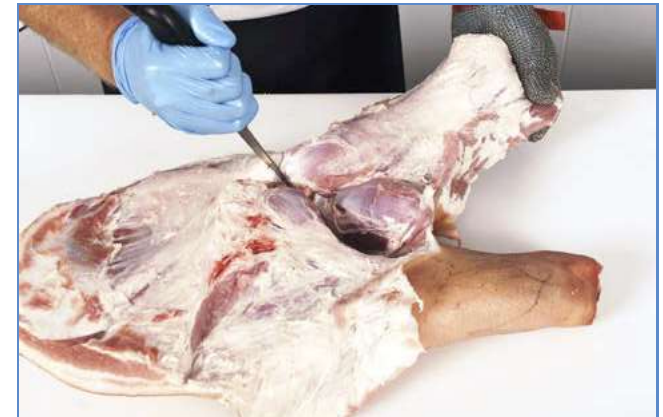
3 ... back towards the humerus.