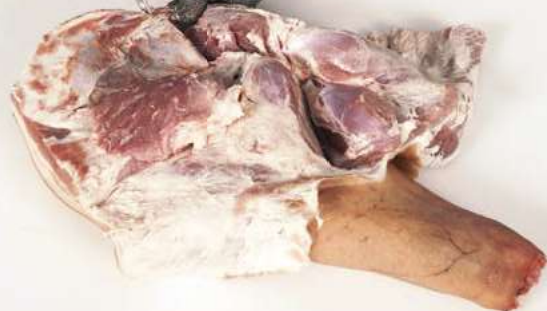
4 Follow the contours of the shoulder blade...