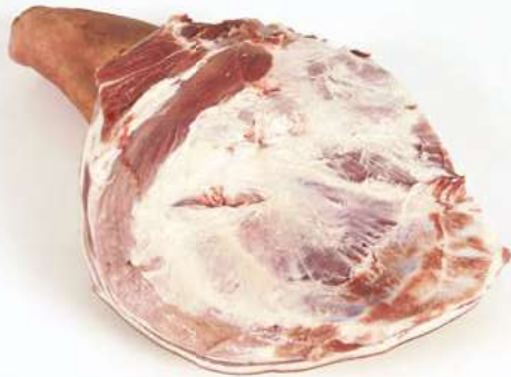
1 Shoulder – round.