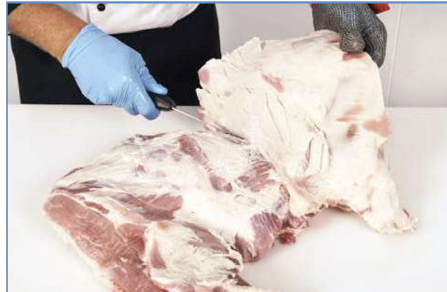
8 Remove the rind including excess fat.