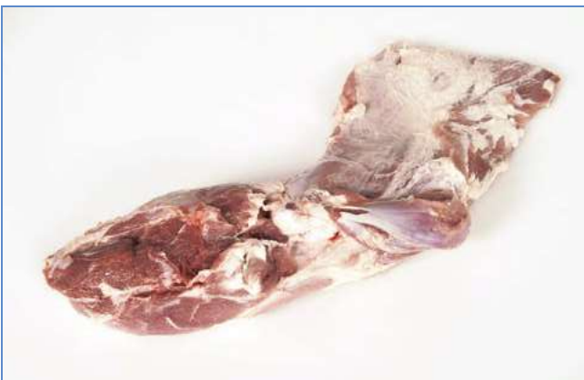
10 Blade and brisket muscle.